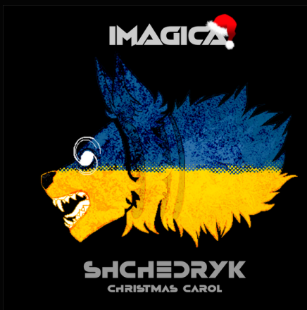
'Shchedryk' (Bonus Track)