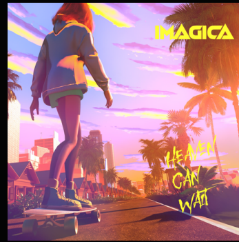
'Heaven Can Wait'

A metal interpretation of a Ukrainian folk song, which later became world known as 'Carol of the Bells', Ukrainian people call it 'Shchedryk'. Was composed by request of Ukrainian friends to congratulate the soldiers on the frontline with Christmas. After 26 hours of work, the demo track was recorded and then re-recorded and mixed in the studio.